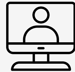
Interactive eLearning Resources