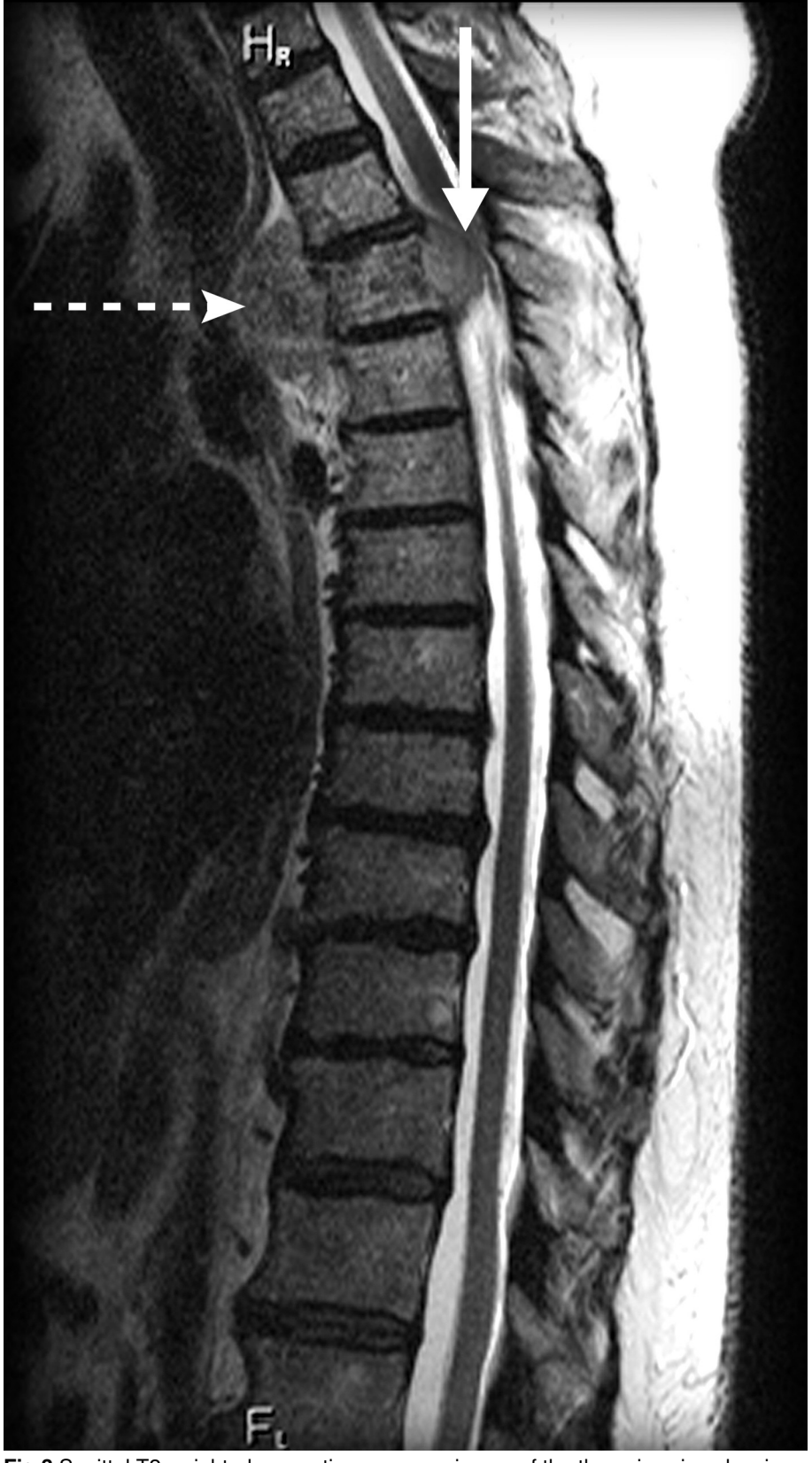
Fig 3 Sagittal T2 weighted magnetic resonance image of the thoracic spine showing a tumour mass in the upper thoracic spinal canal (solid arrow) and in the prevertebral region just in front of the spine (dashed arrow). The spinal canal component is causing compression of the underlying spinal cord.